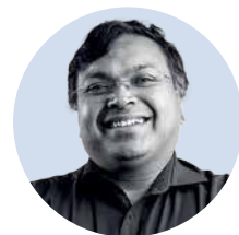
By DEVDU TT PATTANA I K

Hinduism thrives on diversity, transcends the equality of Abrahamic faiths or the monotheism of Hindutva