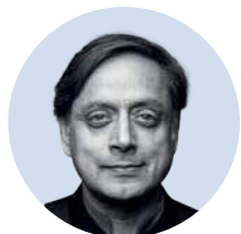
By SHASHI THAROOR