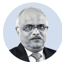
By DR VINAY SAHASRABUDDHE

Hindus face a challenge—technically, Hinduism is like other beliefs. Practically, it is much more, hence the confusion