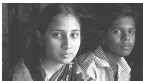
This girl was 14 when she married her 19-year-old husband.

husband a year ago. Her life now is radically different to her carefree childhood. "After marriage, what is my work now? Washing dishes, cleaning the floor, washing clothes and cooking," she said.